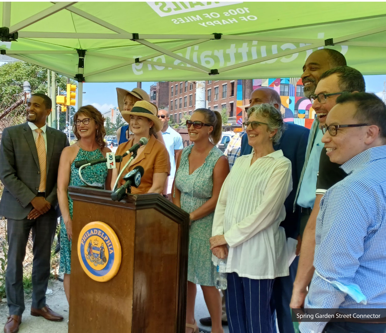
Spring Garden Street Connector